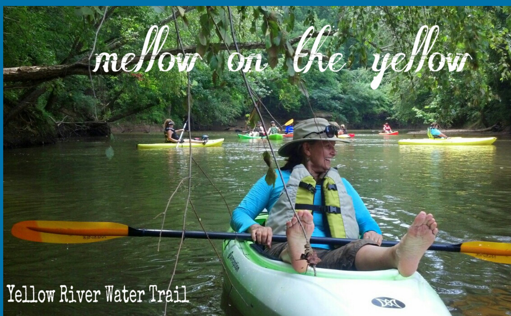
Yellow River Water Trail

The Yellow River Water Trail is made possible through the generous support of: